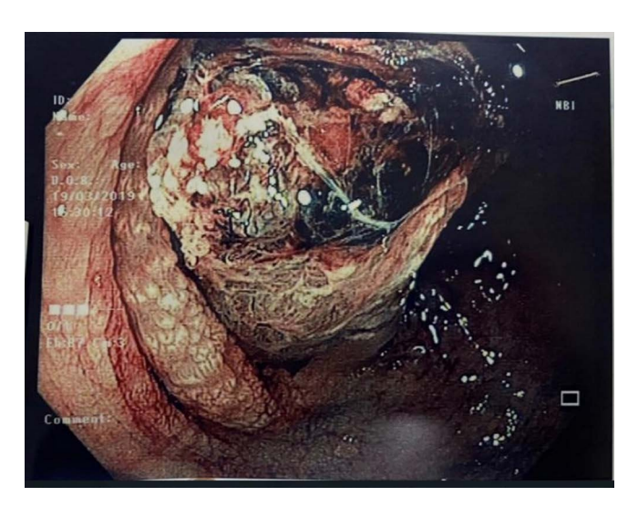
Figure 1. Endoscopic image of a mass at the upper rectum 18 cm from the anal verge.

The patient then underwent a laparoscopic anterior resection with a covering ileostomy. The final histopathologi-